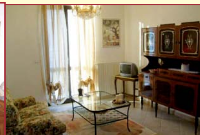
Inside views of the flats