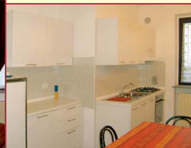
Inside views of the flats